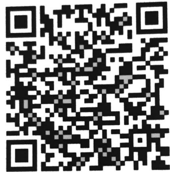
QR Code Bus